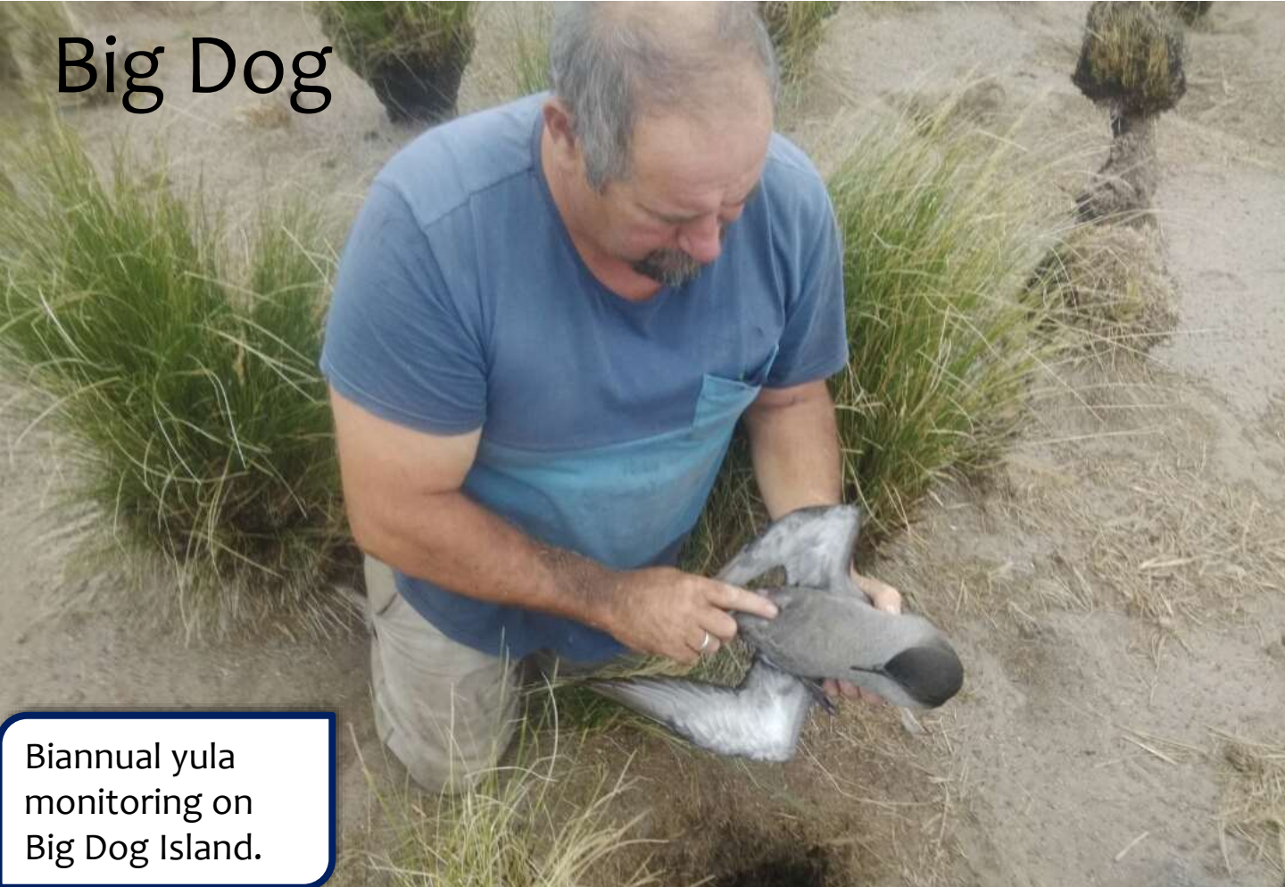
Biannual yula monitoring on Big Dog Island.