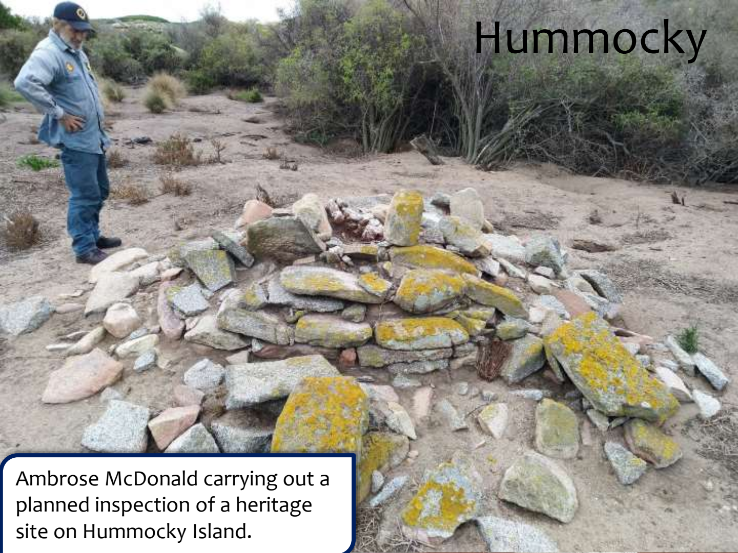
Ambrose McDonald carrying out a planned inspection of a heritage site on Hummocky Island.