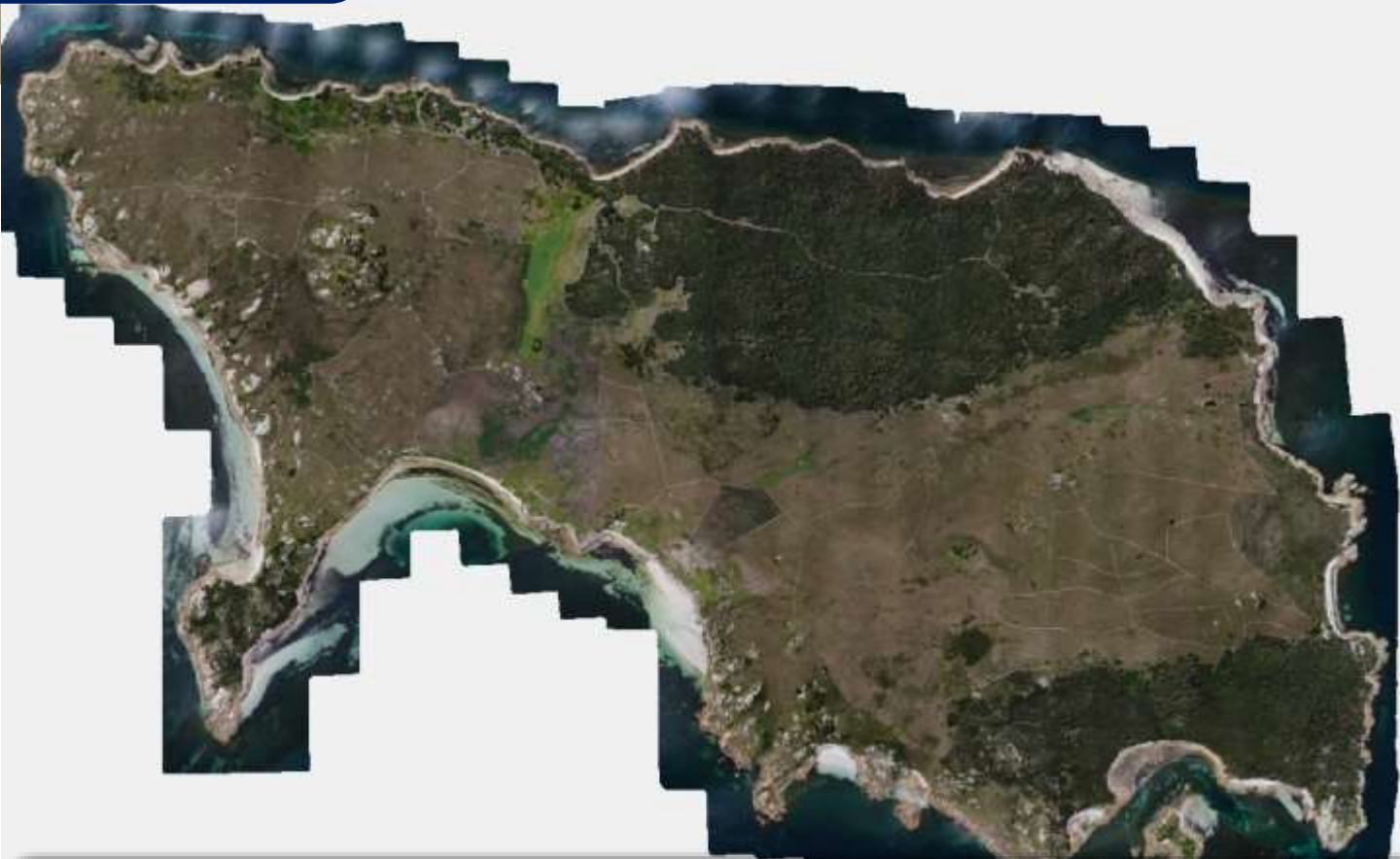
A high resolution map of the Island was made during the yula monitoring providing the land managers with a valuable new tool to monitor land management activities on the island.