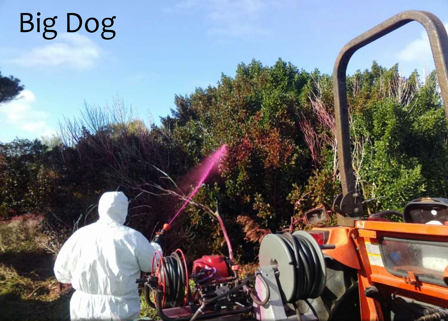
Weed eradication efforts on Big Dog