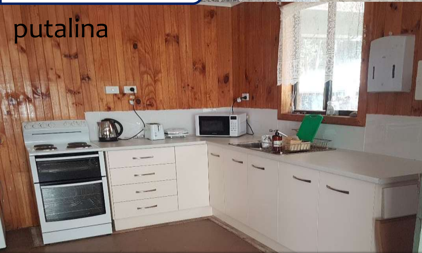
The southern land management crew have fitted out a new kitchen in the Morgan Mansell Hut at putalina.