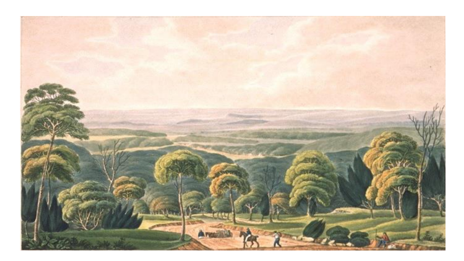
From Lycett's Drawings of the Natives and Scenery of Van Diemens Land, London 1830, PIC R5689, NLA.

Joseph Lycett's painting 'View from near the Top of Constitution Hill, Van Diemen's Land', c.1821, shows a landscape of alternating belts of forest and plains, indicative of the terrain which at that time stretched to Bagdad and beyond, encompassing the Pontville and Mangalore areas. <sup>17</sup>